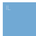
light blue 5513